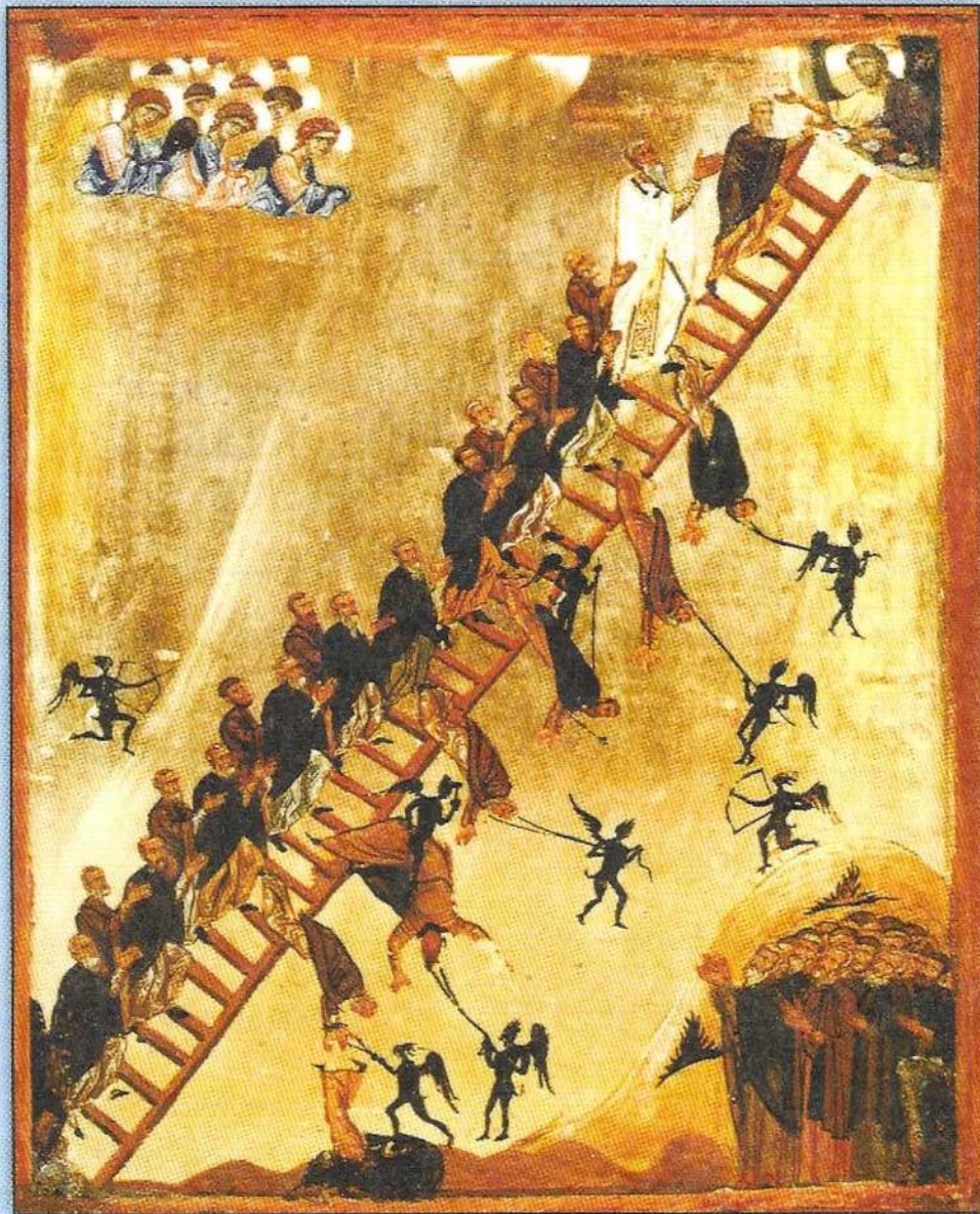
Icon of the the Ladder of Divine Ascent