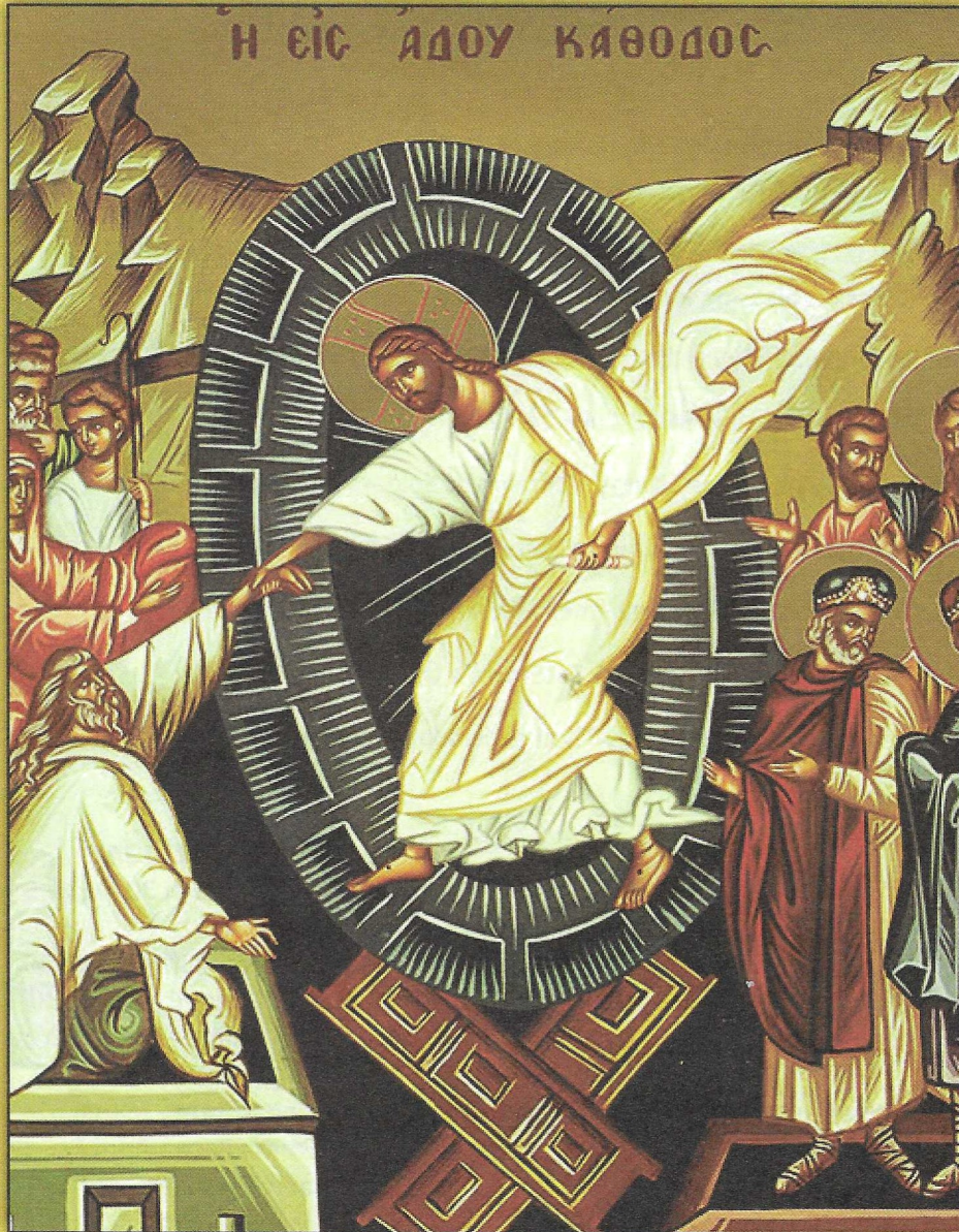
Icon of the Descent into Hades