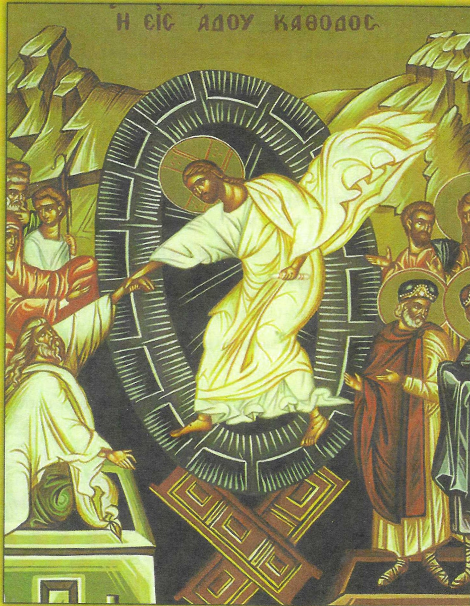
Icon of the Descent into Hades