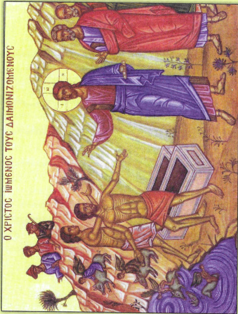
Icon of Healing the Gadarene Demoniacs (Luke 8:26-39)