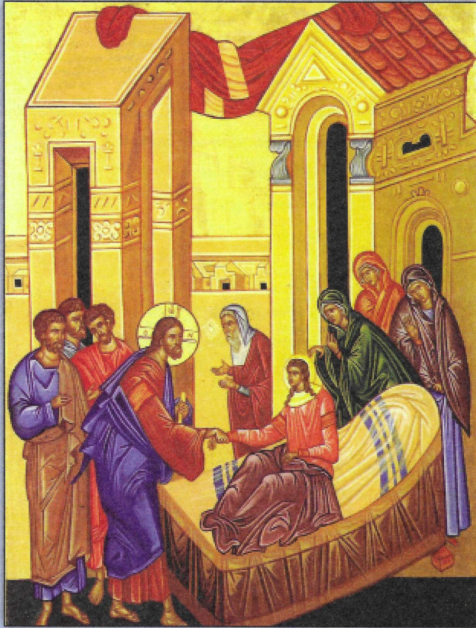
Icon of Healing Jairus' Daughter (Luke 8:41-56)