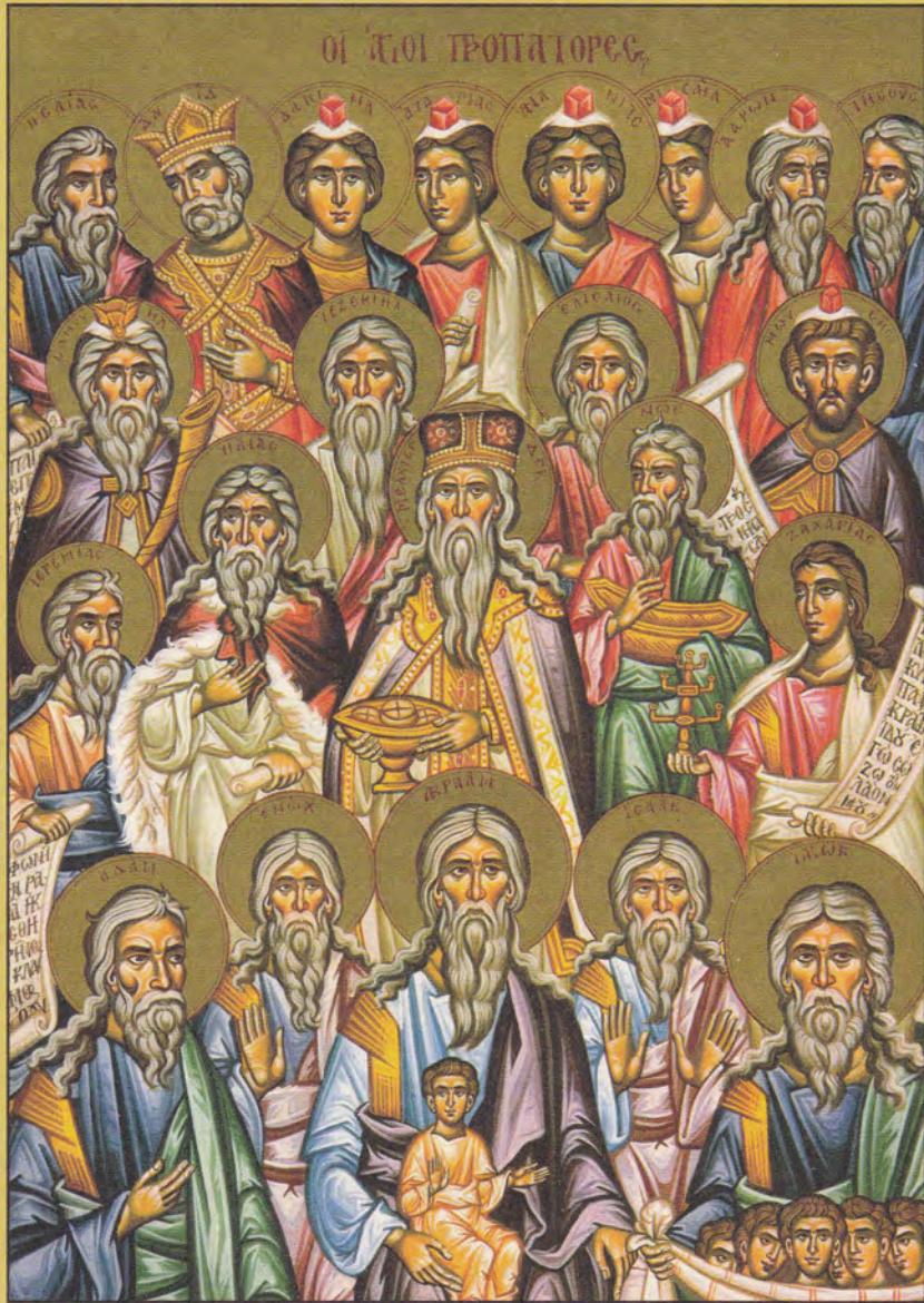
Icon of the Sunday of the Forefathers