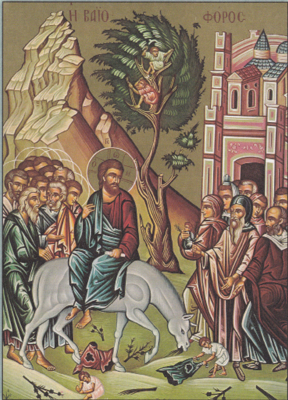
Icon of the Entrance into Jerusalem