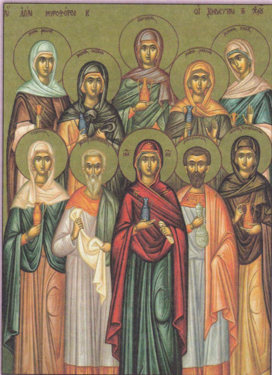
Icon of the Myrrh-bearing Women