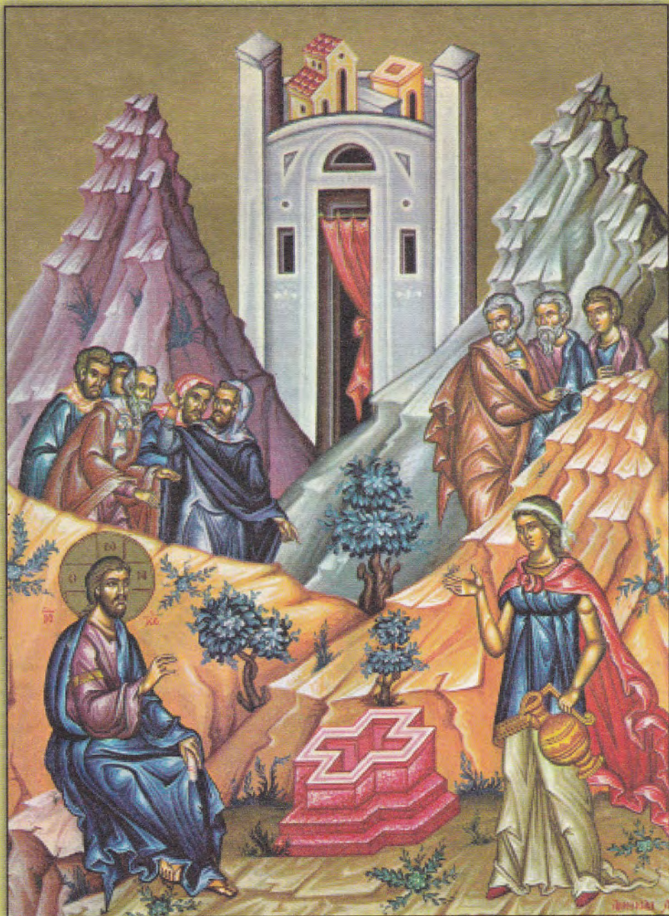
Icon of Christ with the Samaritan Woman