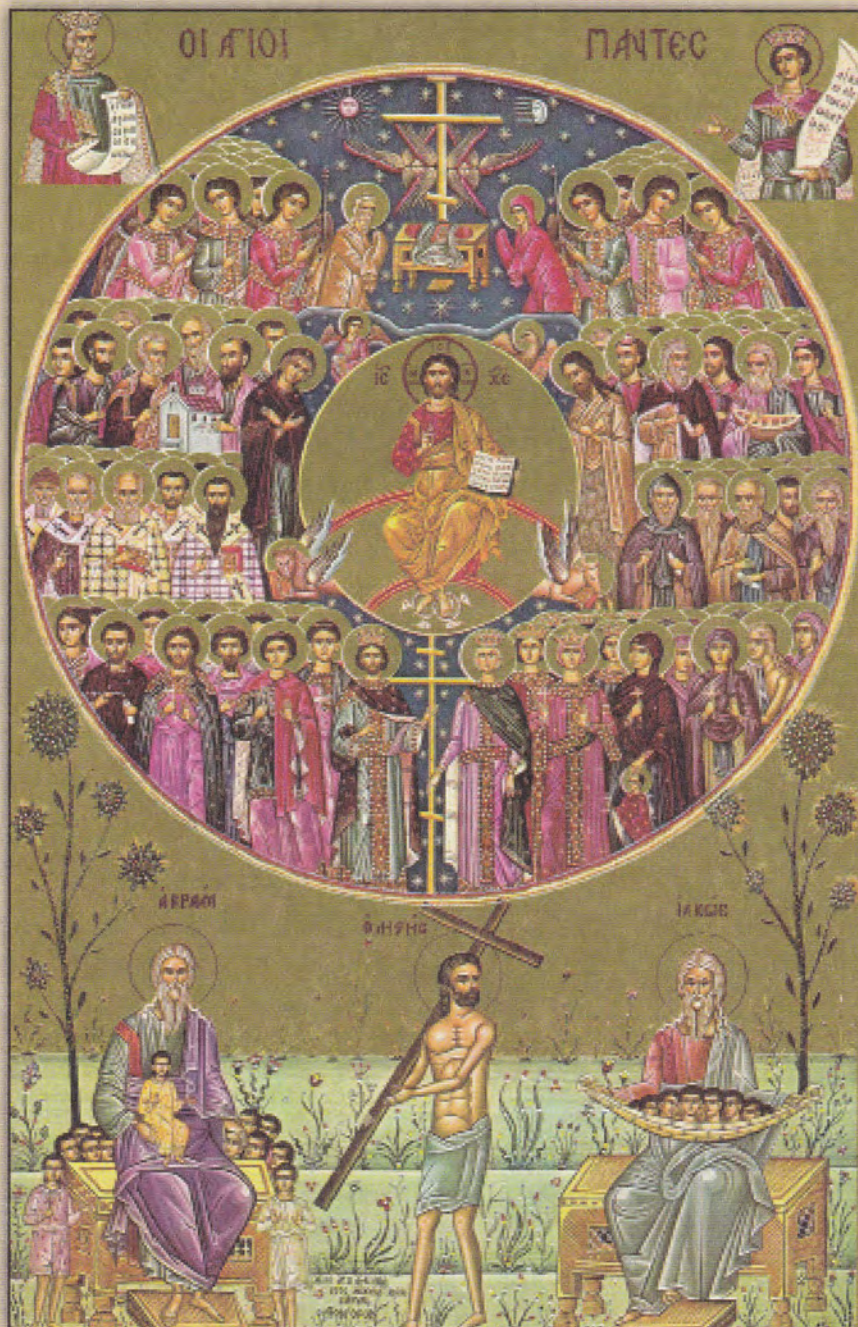
Icon of All Saints