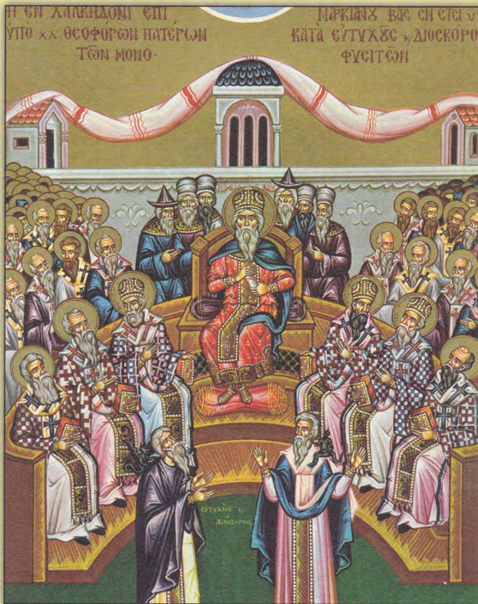
Icon of the Holy Fathers