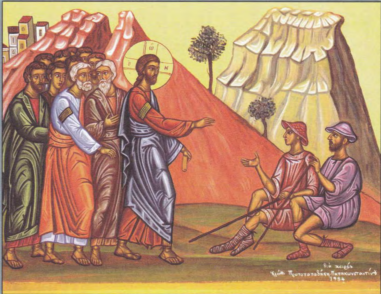
Icon of Healing Two Blind Men