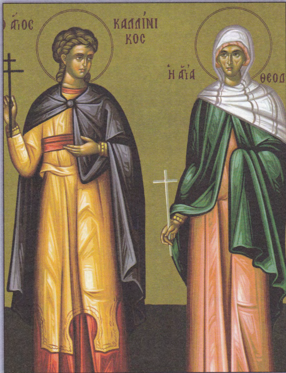
Icon of Saints Callinicus and Theodotia -- July 29th