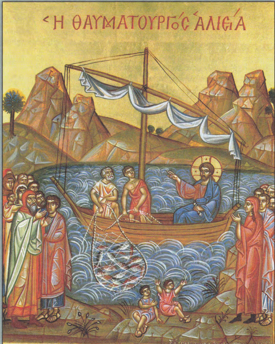
Icon of the Call of the Apostles (Luke 5:1-11)