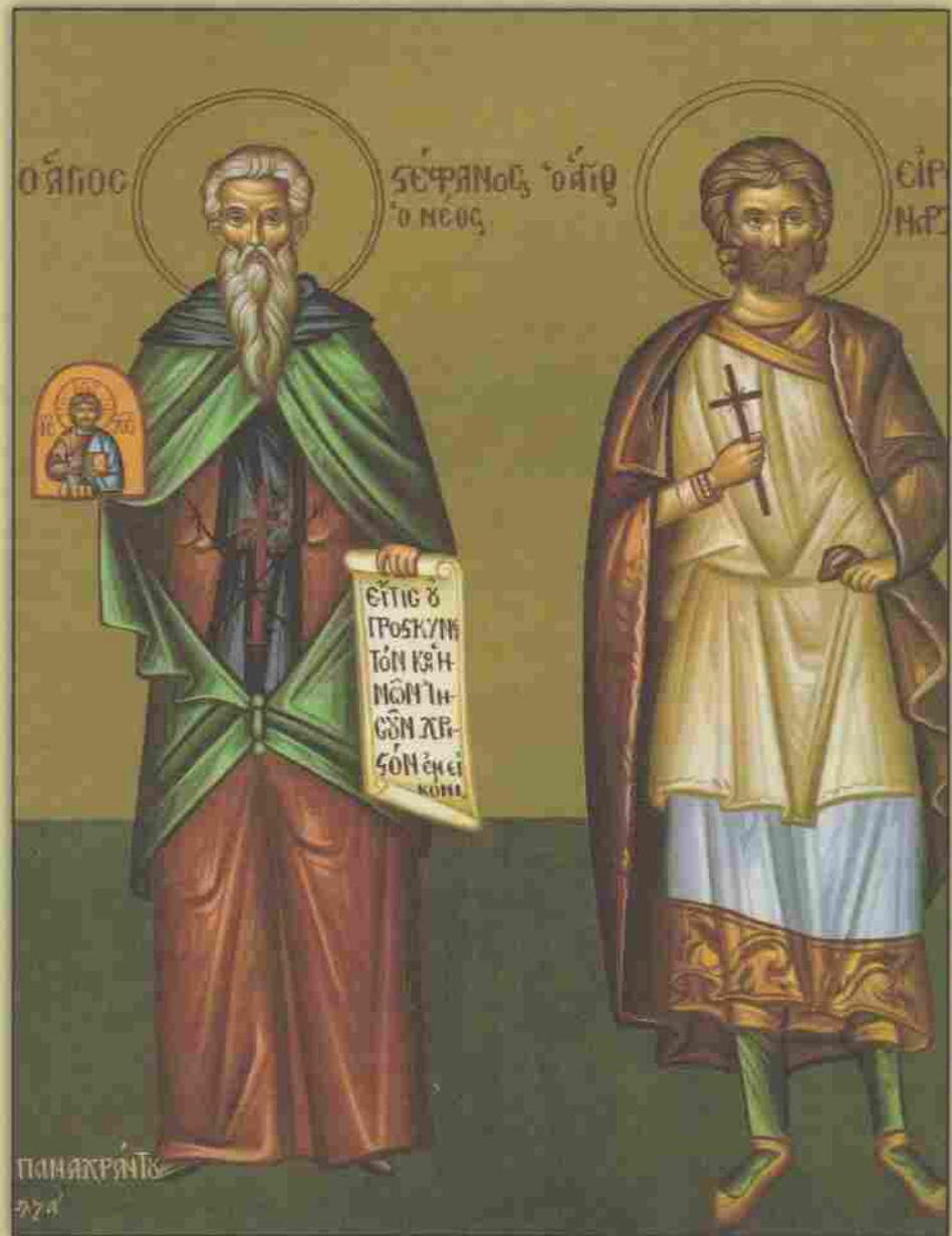
Icon of Saints Stephen and Irenarchus -- November 28th