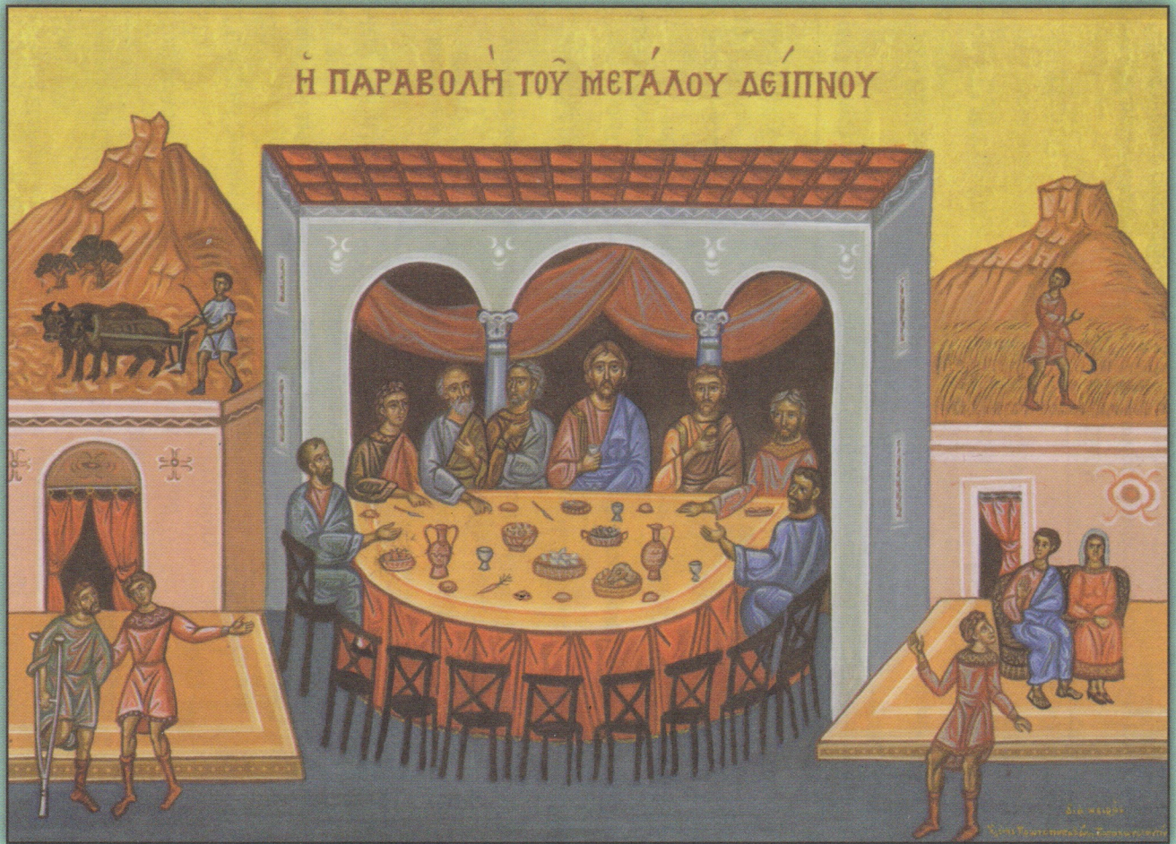
Icon of the Parable of the Great Feast