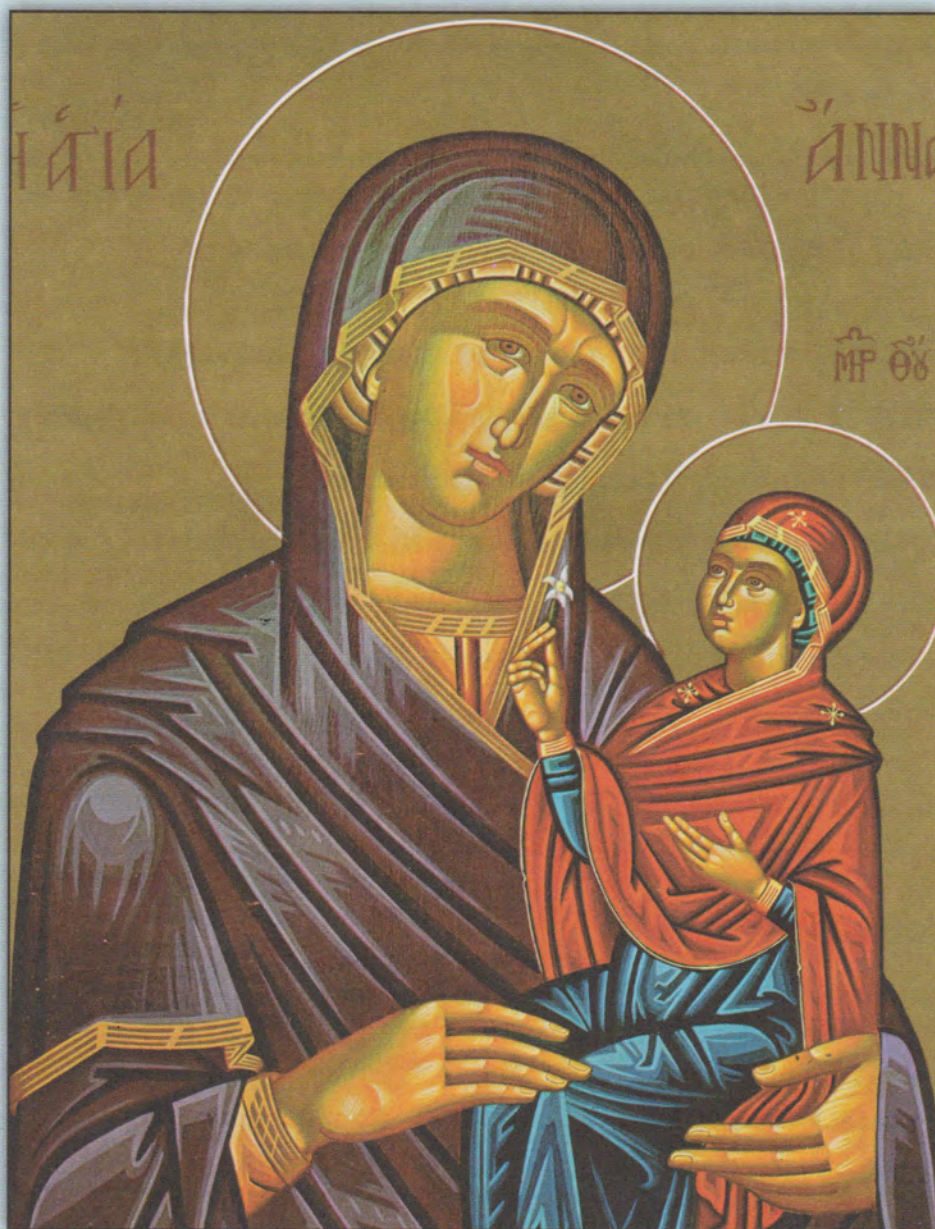
Icon of Saint Ann and Mary -- December 8-9