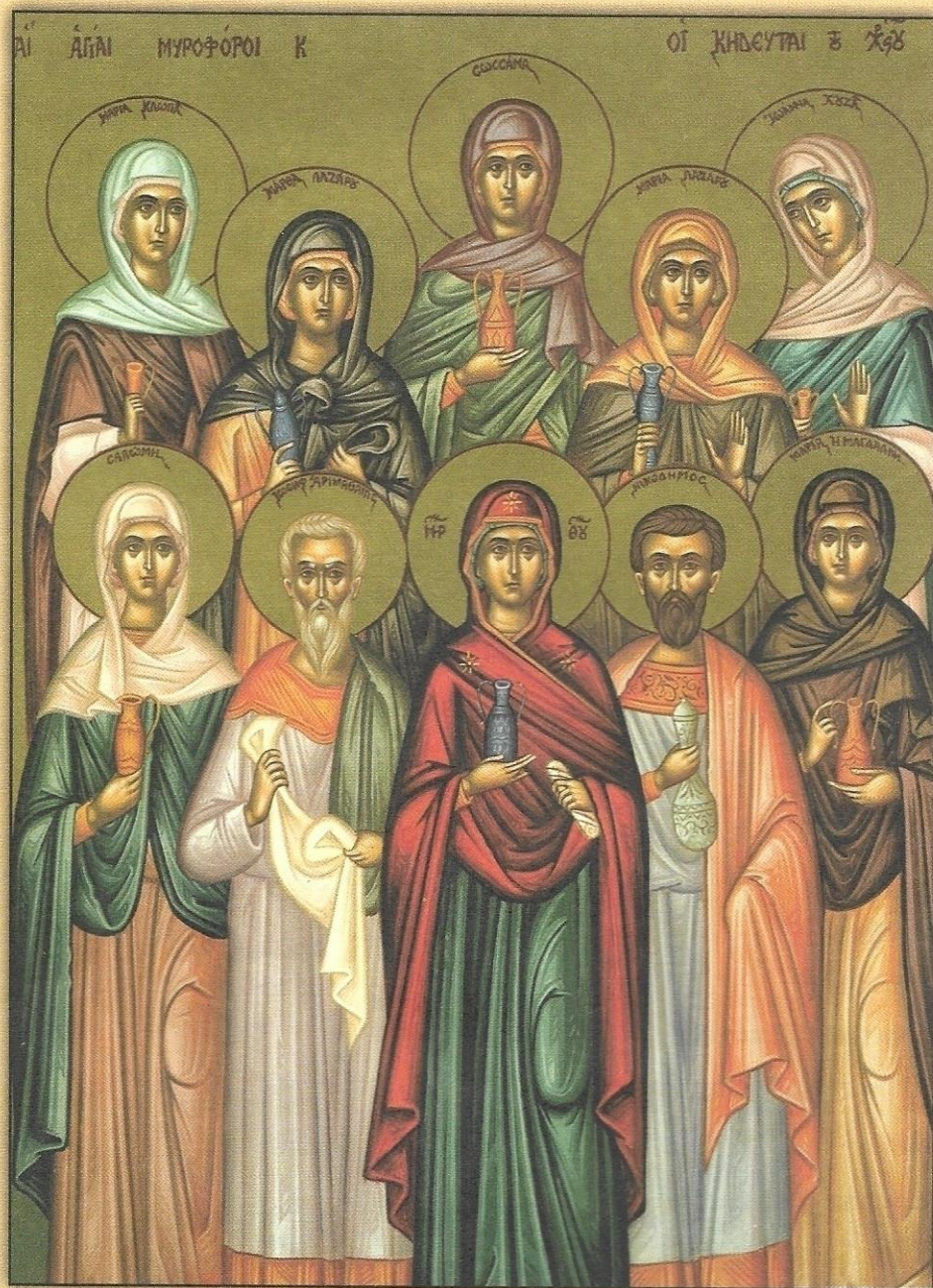
Icon of the Myrrh-bearing Women