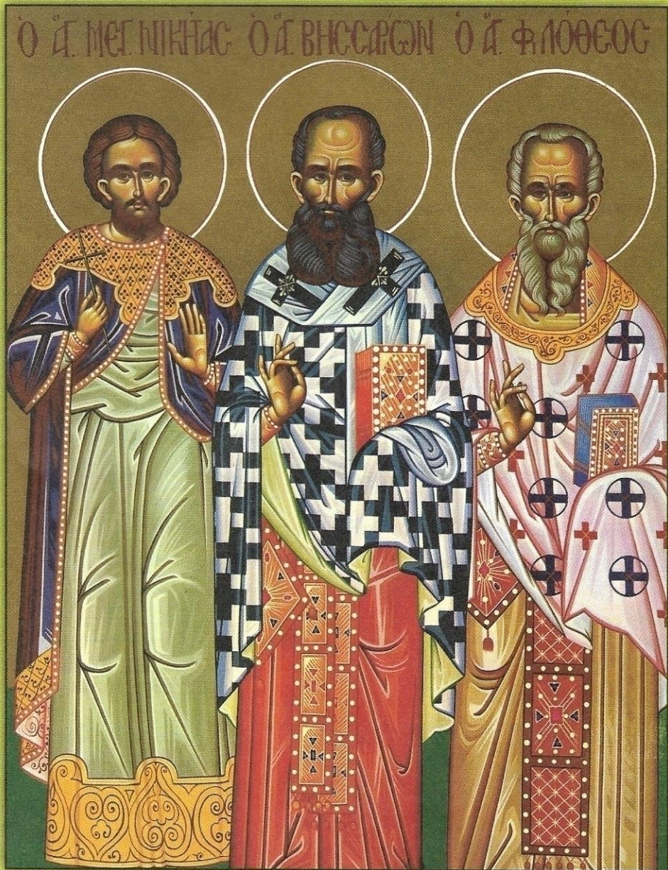
Icon of Saints Nikitas, Bessarion and Philotheos -- September 15h