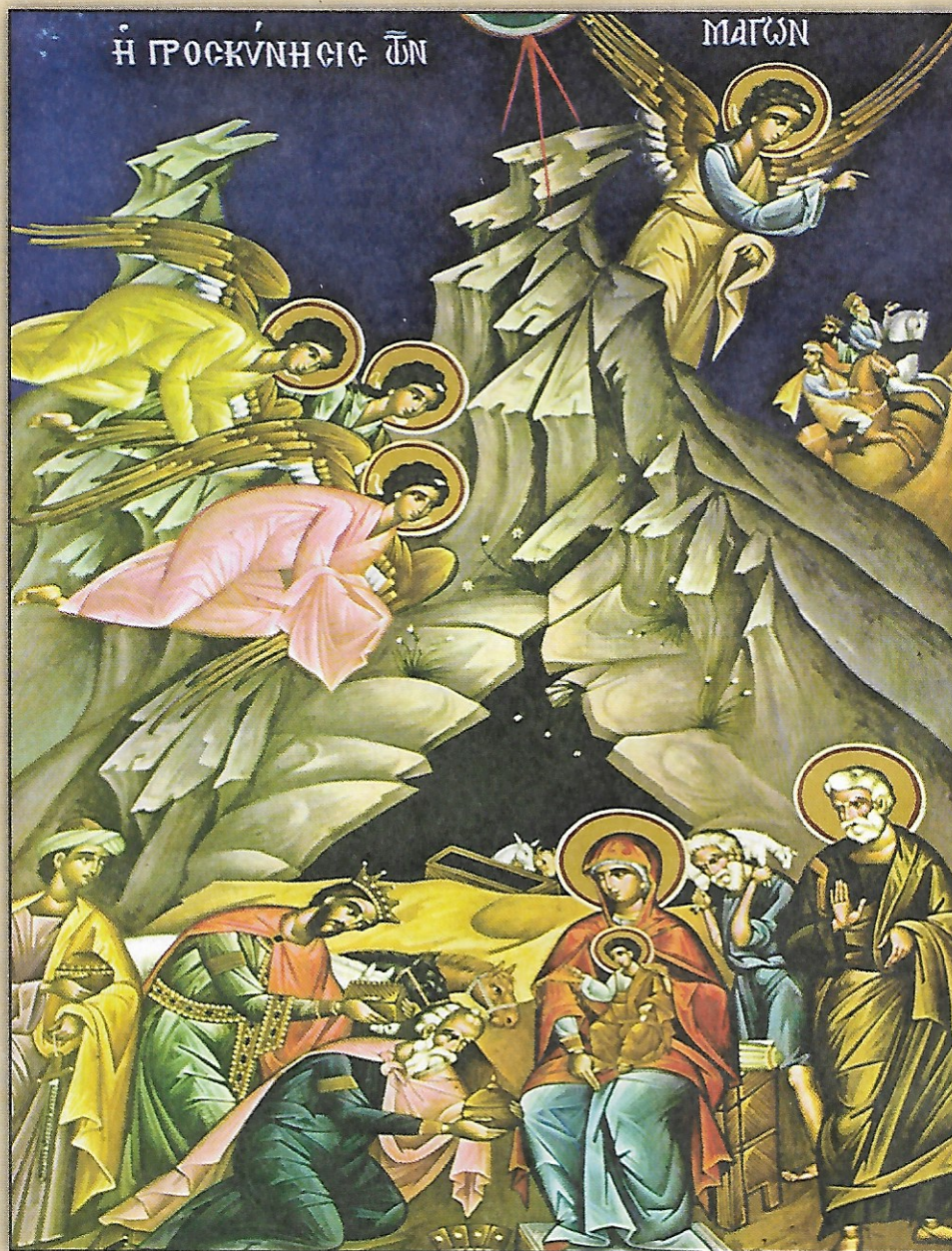
Icon of the Synaxis of the Nativity