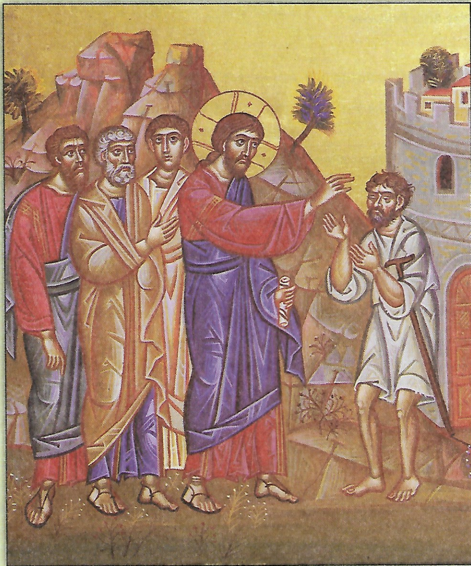
Icon of Jesus Healing a Blind Beggar - Luke 18:35-43