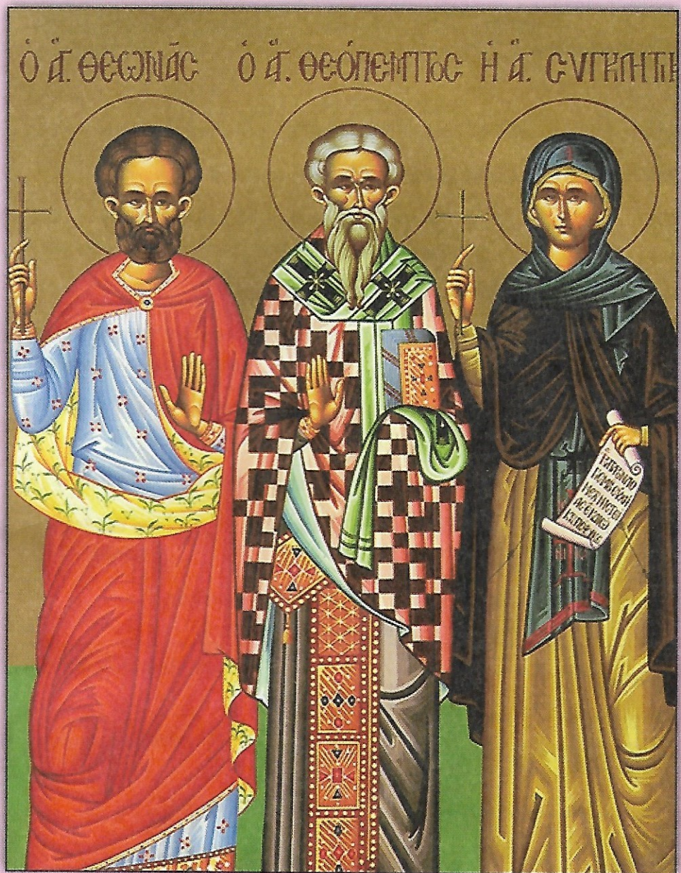
Icon of Saints Theona, Theopempt, and Syncletica -- January 5th