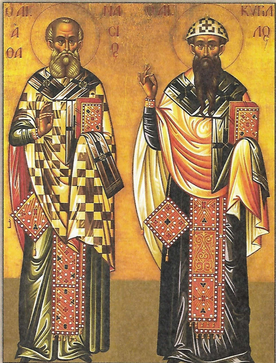
Icon of the Holy Fathers Athanasius and Cyril -- January 18th