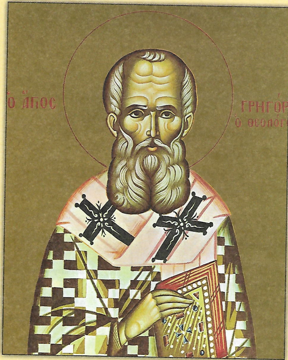
Icon of Saint Gregory the Theologian -- January 25th