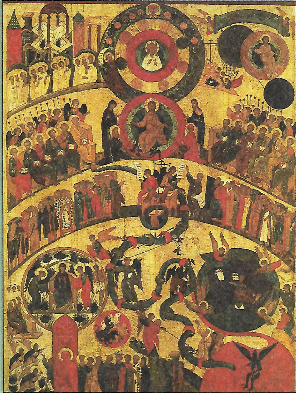
Icon of the Last Judgment