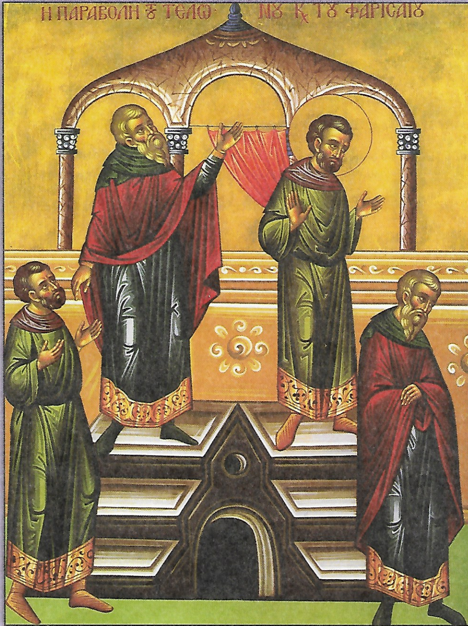
Icon of the Publican and Pharisee