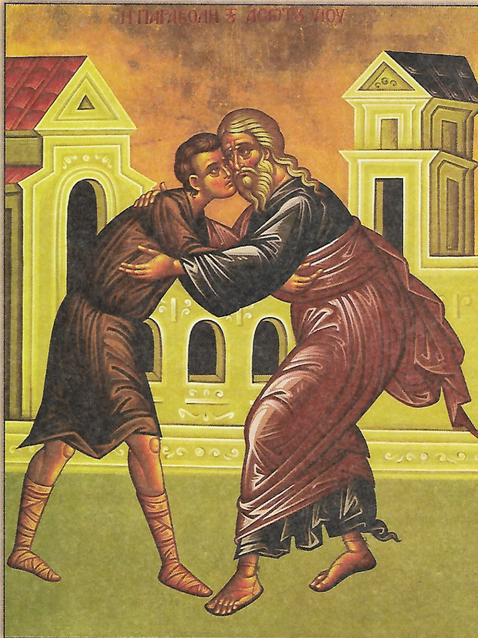
Icon of the Prodigal Son