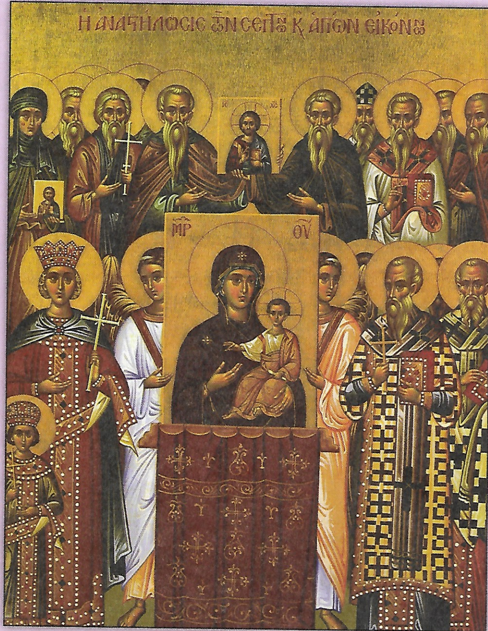
Icon of Holy Images