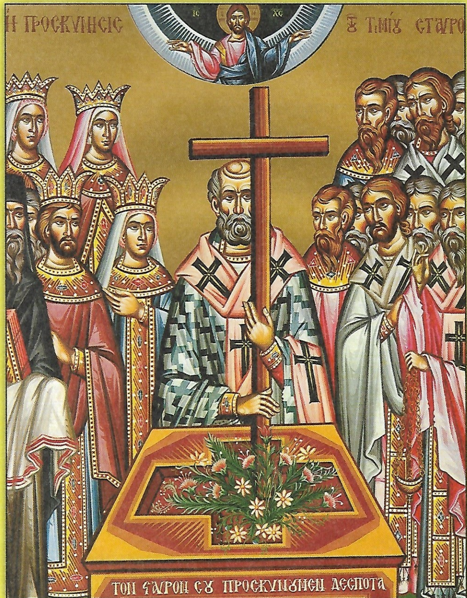
Icon of the Veneration of the Holy Cross