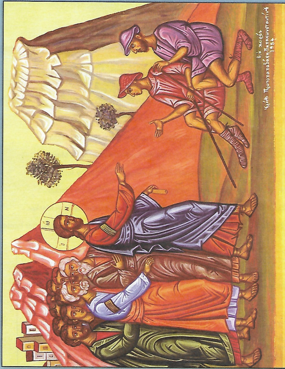
Icon of Healing Two Blind Men