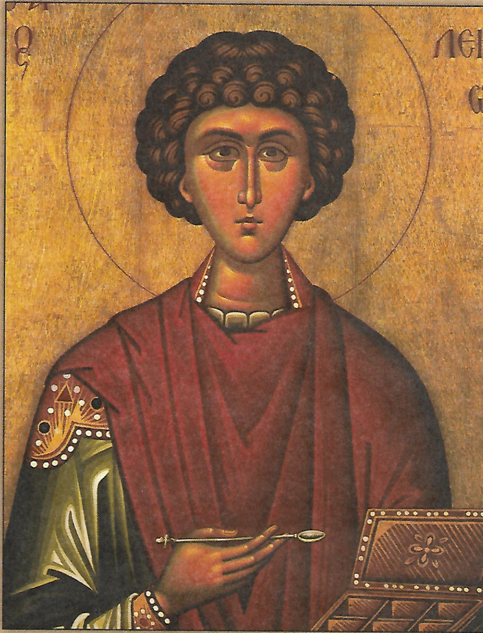
Icon of Saint Panteleimon -- July 27th