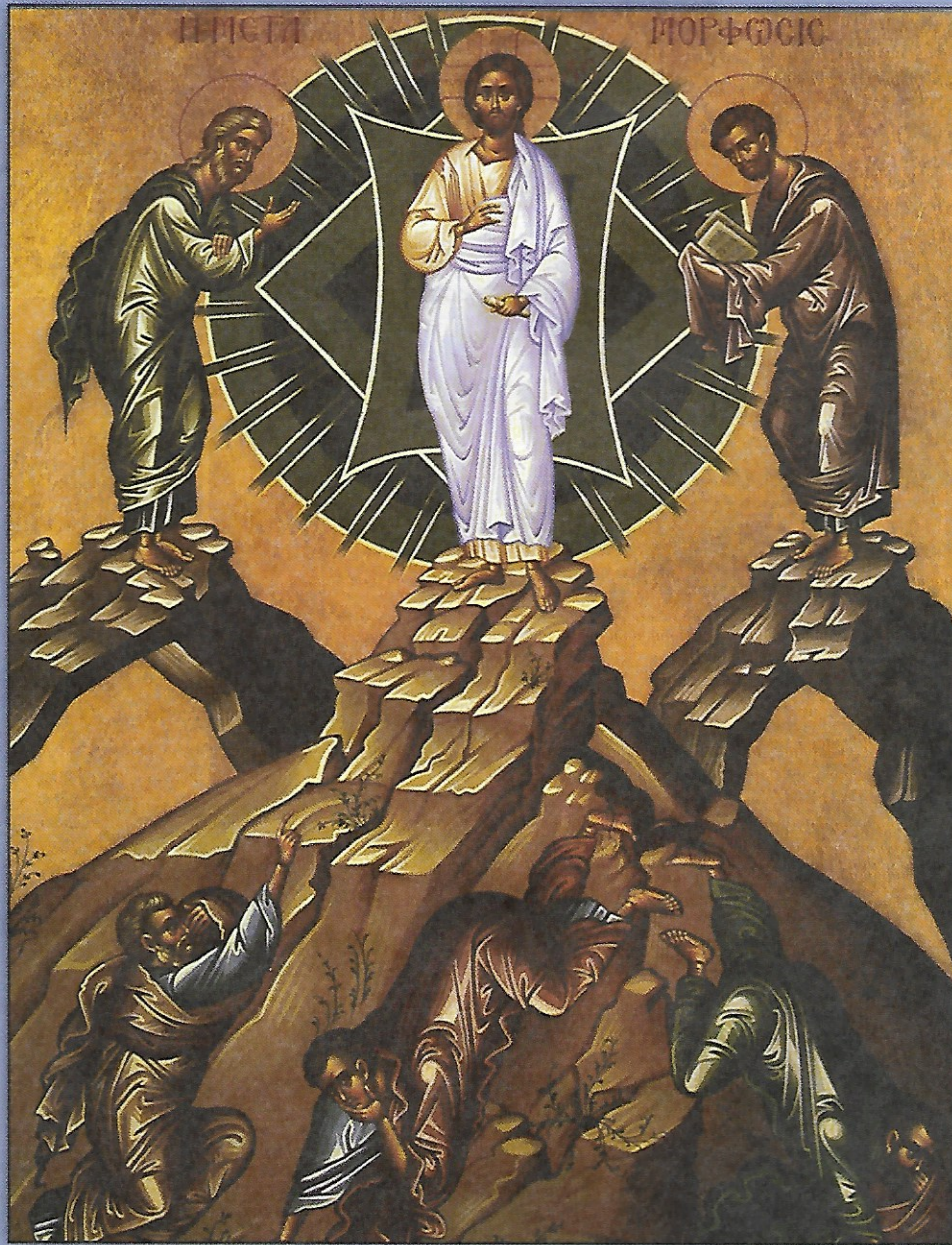
Icon of the Transfiguration -- August 6th