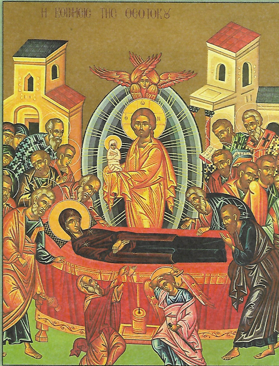
Icon of the Dormition -- August 15th