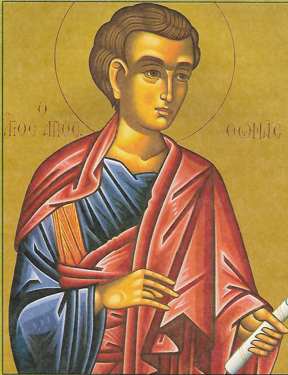
Icon of Saint Thomas -- October 6th