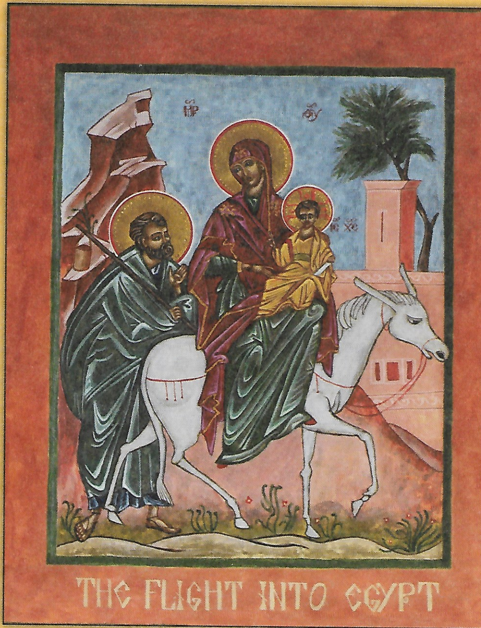
Icon of the Flight into Egypt -- Matthew 2:13-23