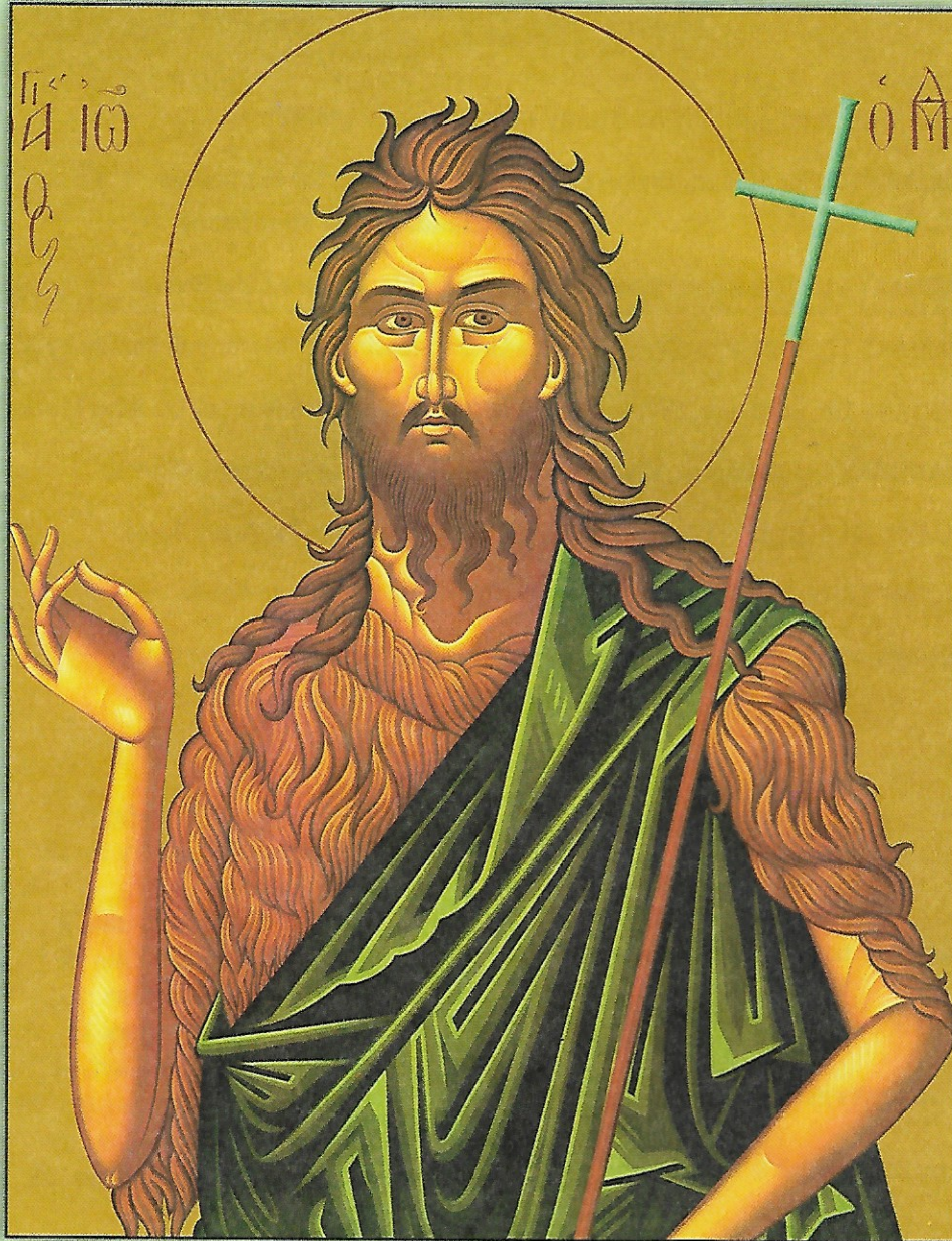
Icon of Saint John the Baptist