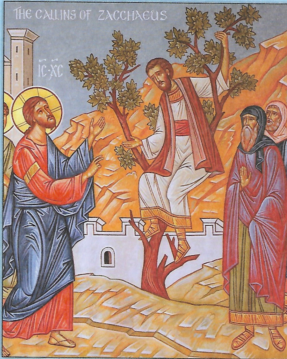
Icon of Zacchaeus in the Sycamore Tree