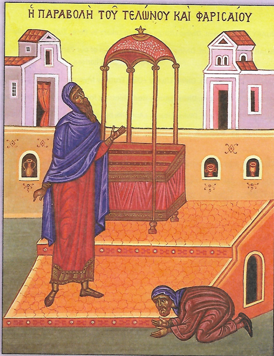
Icon of the Publican and Pharisee