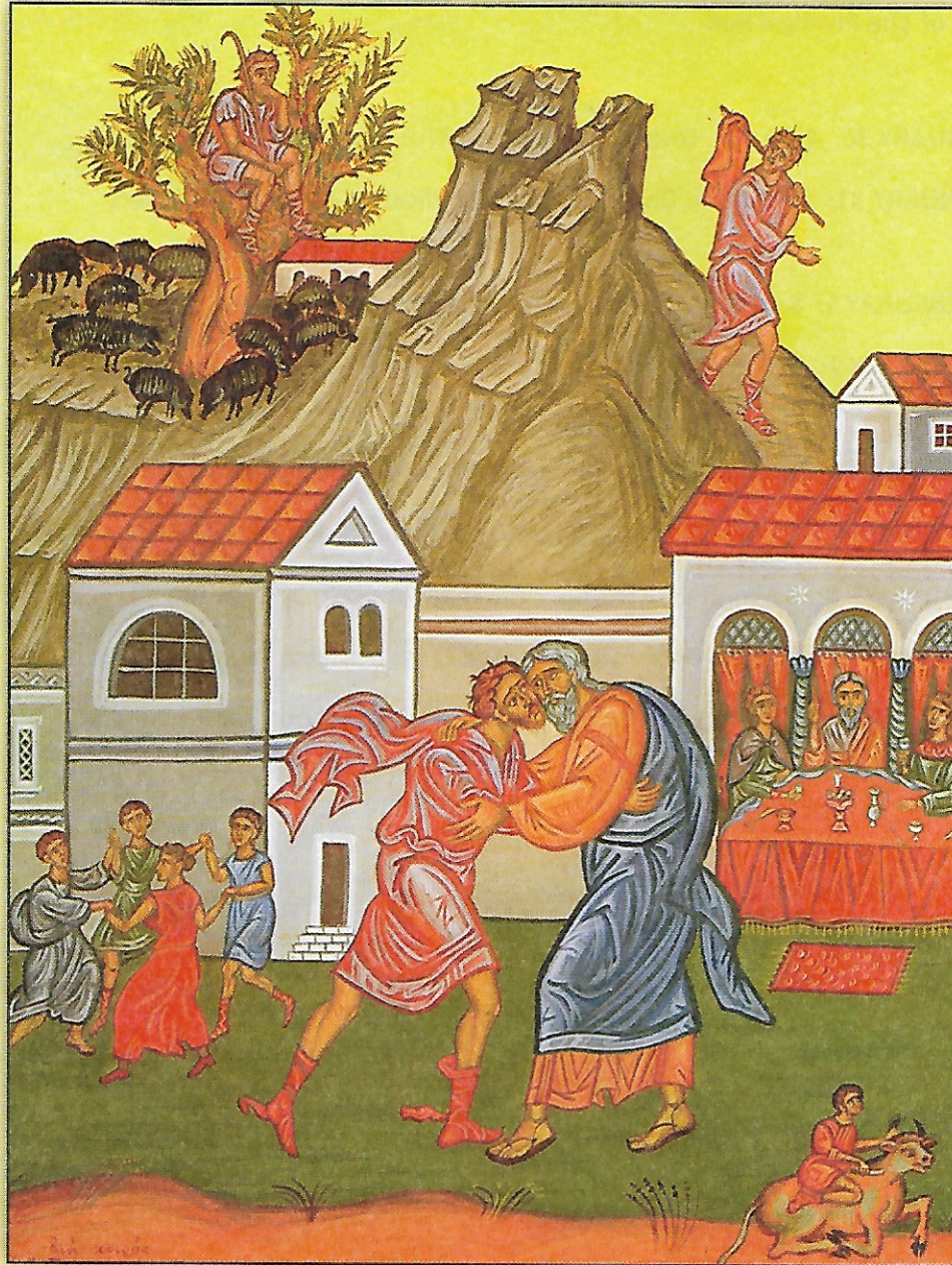
Icon of the Prodigal Son