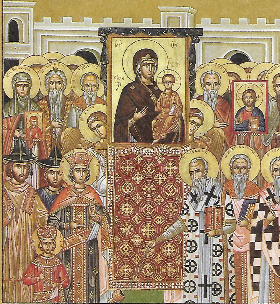
Icon of the Holy Images