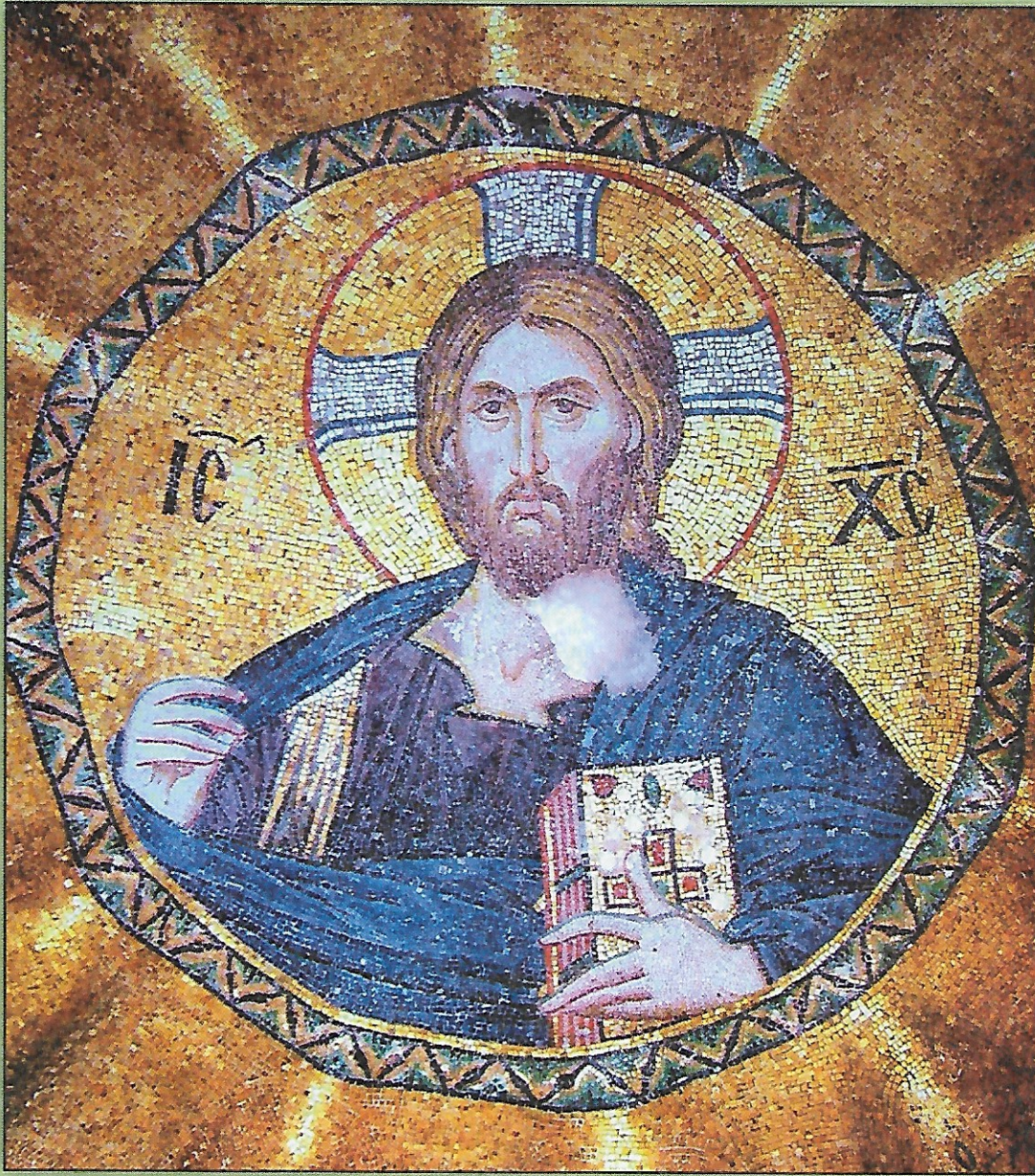
Icon of Christ Pantocrator