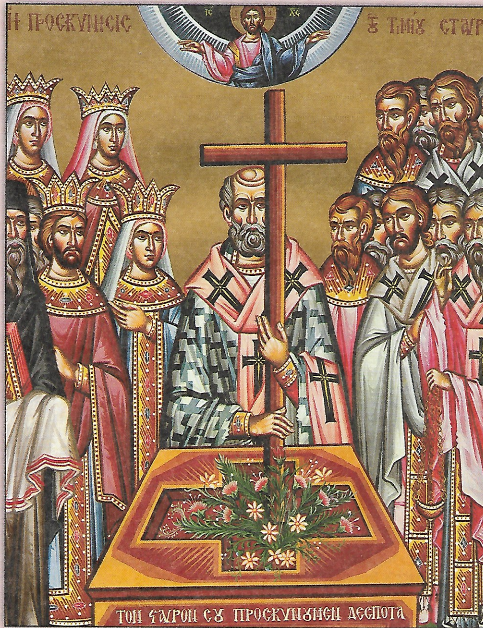
Icon of the Sunday of the Holy Cross