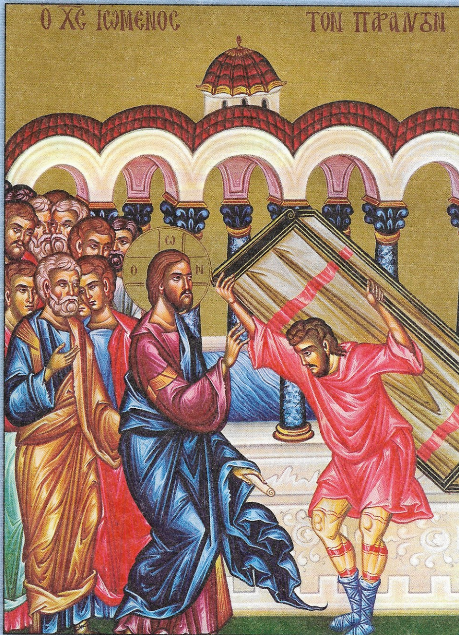
Icon of Jesus Healing the Paralytic Man