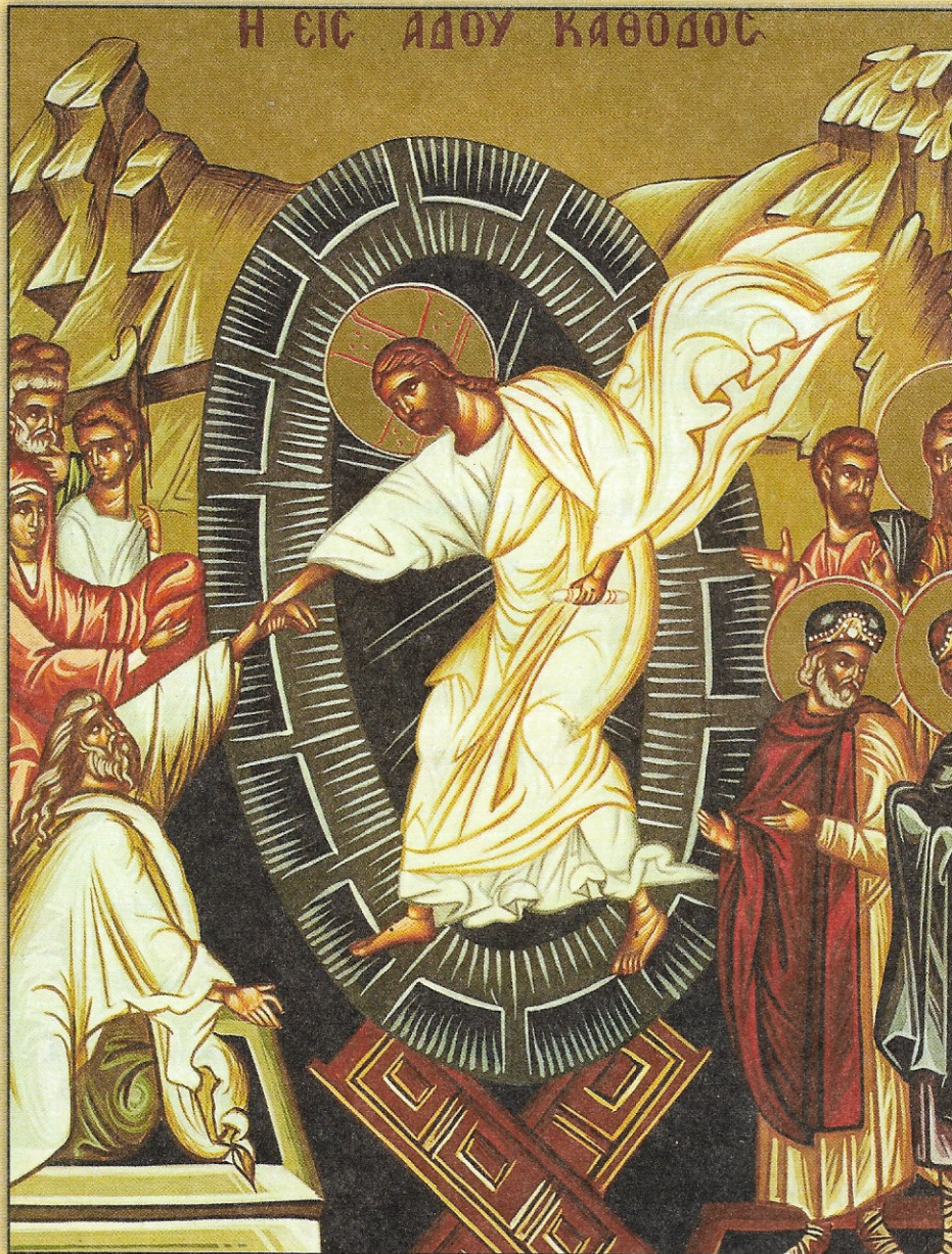
Icon of the Descent into Hades