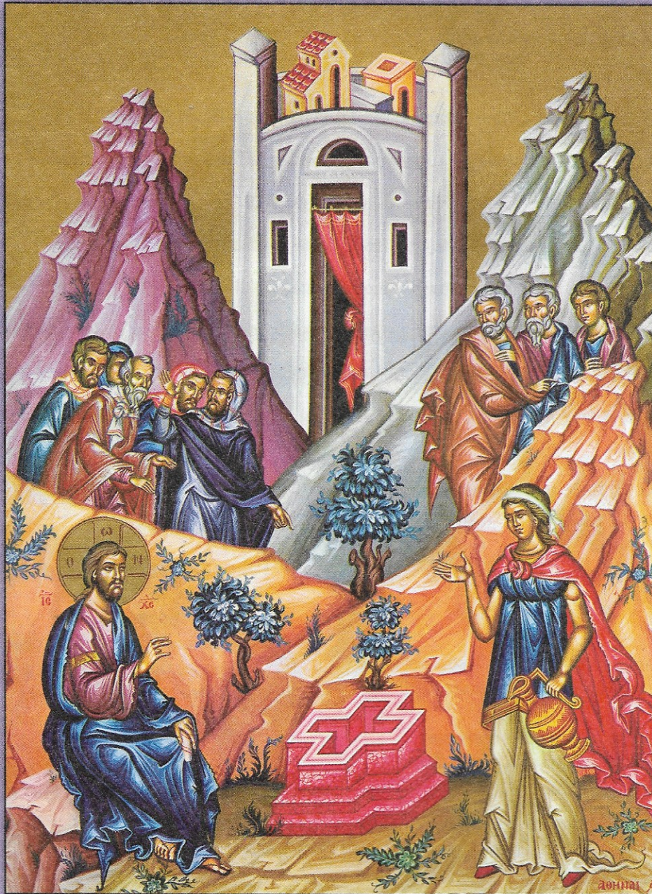
Icon of Christ with the Samaritan Woman