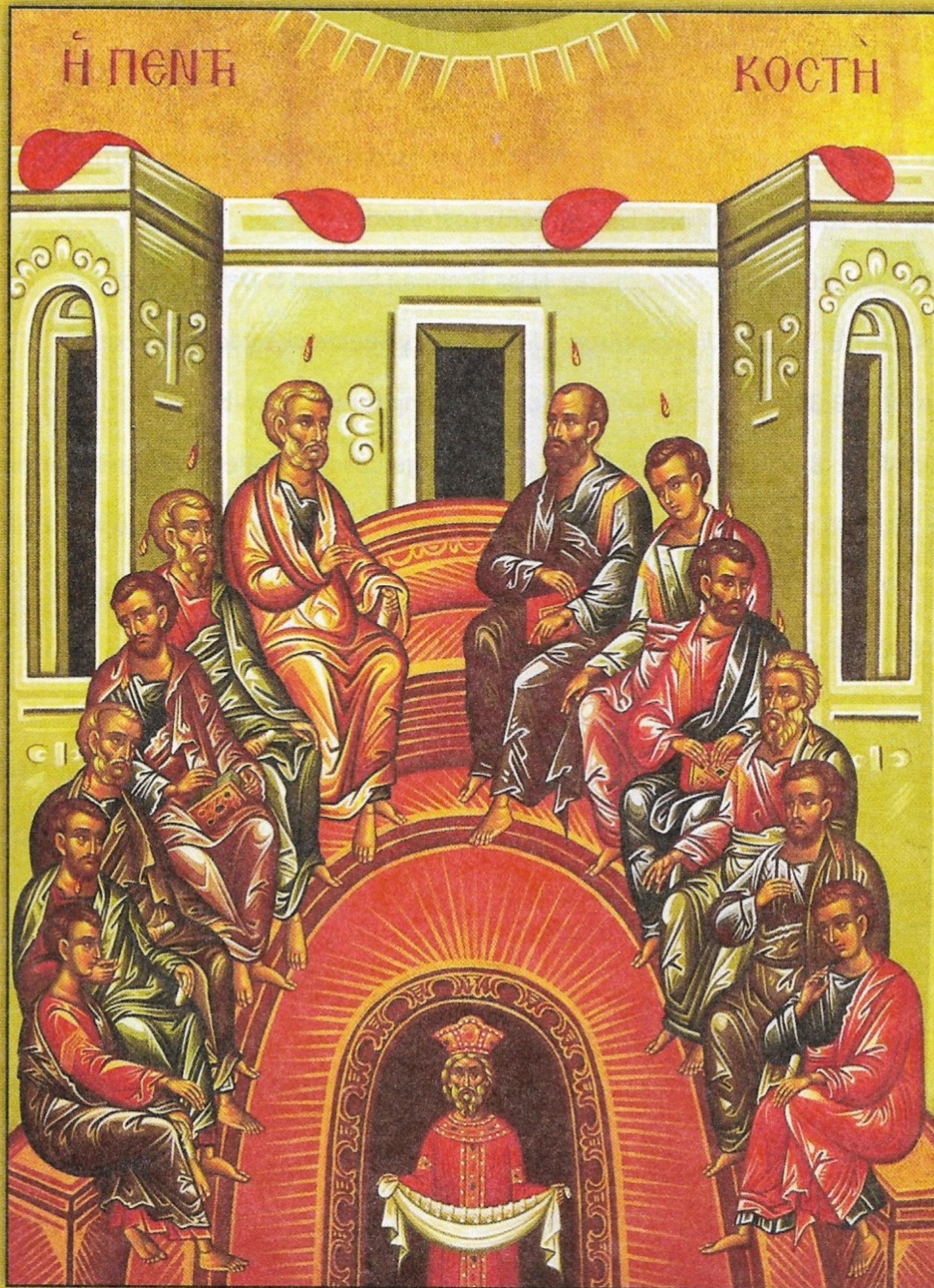
Icon of Pentecost