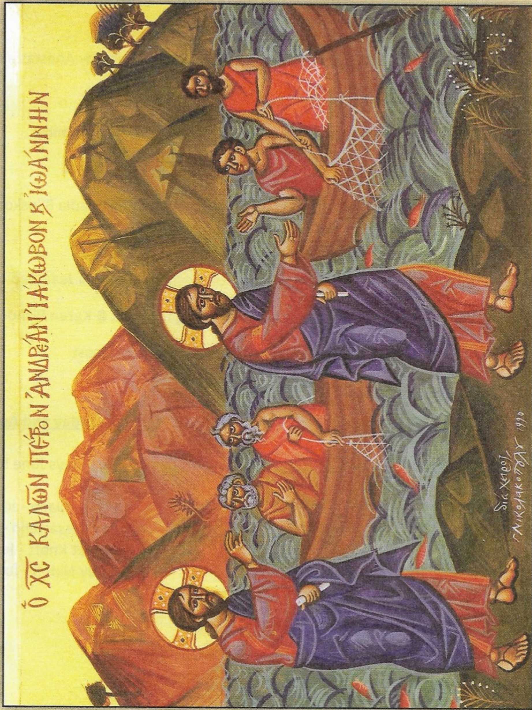
Icon of the Call of the Apostles