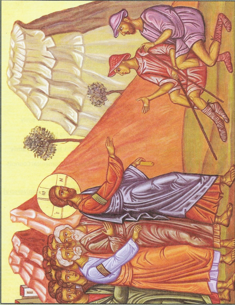
Icon of Healing Two Blind Men