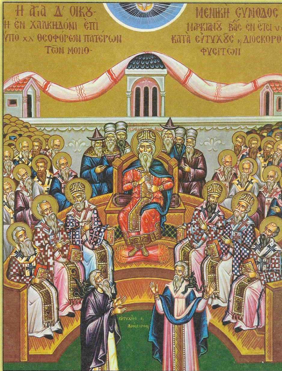
Icon of the Holy Fathers