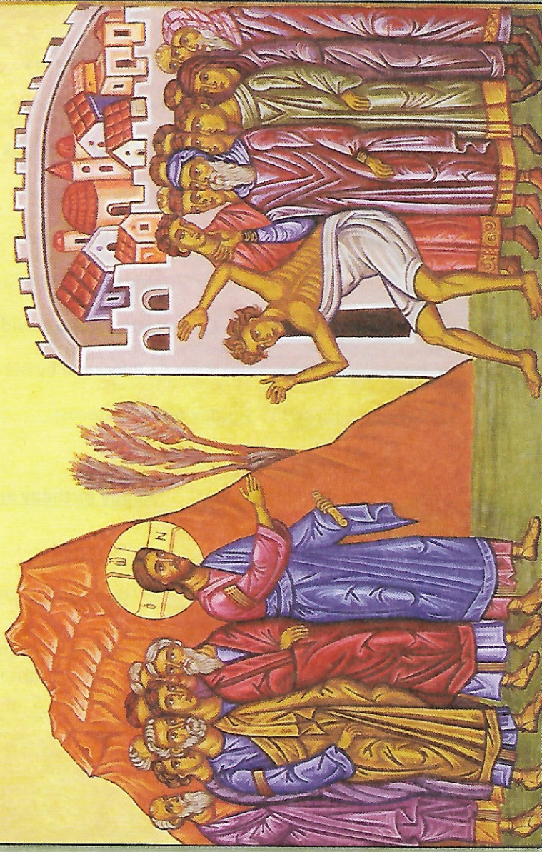
Icon of the Healing of the Demoniac Boy

Ο ΧΡΙΣΤΟΣ ΙΩΗΕΝΟΣ ΤΟΝ ΔΑΙΜΟΝΙΖΟΜΕΝΟΝ ΚΩΦΟΝ